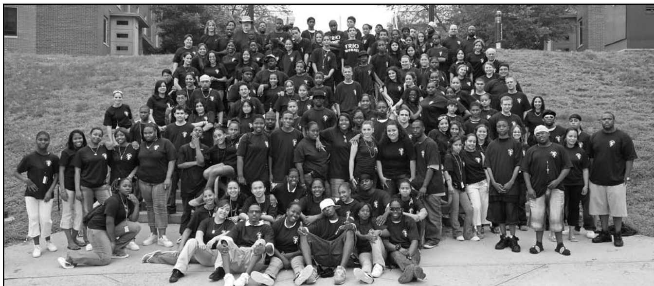
Summer 2006 UB Students

level of achievement equivalent to that acquired by students in the Physics courses 121 and 122, and so students passing the third year would earn University credit for those courses. The advantages of this curriculum are several fold, not the least of which is the availability of many proven assessment tools. In addition, the granting of college credit for passing grades should act as an incentive to students to sign up for the physics option. This approach is the one most likely to ‘turn the students on’ to physics. We hope to inspire physics teachers in this program.”