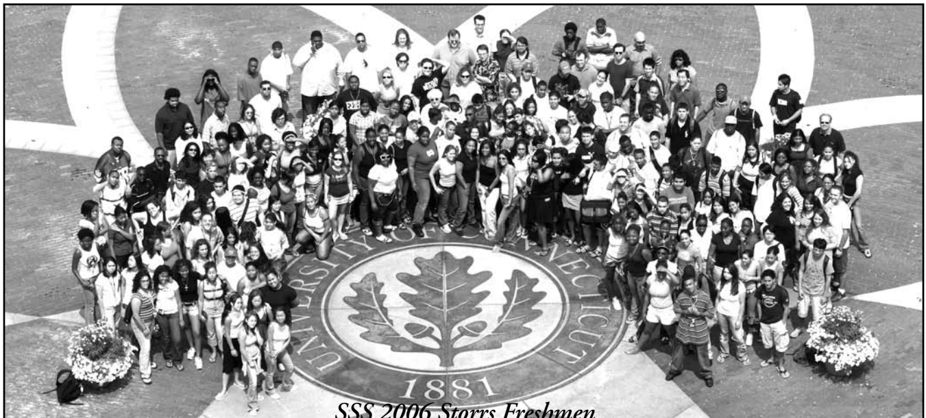
SSS 2006 Storrs Freshmen

hand in hand with the coordinator of the program. I have had the privilege to work and mentor the incoming SSS freshmen. I became an English tutor, and I was able to do what I like most, help other people in an area that I enjoy. As a result, I also received extensive training from the Tri-Campus writing center, where I now work during the school year. The SSS Program is a great opportunity and a huge advantage. I was glad to be accepted into such an honorable program and was able to work closely, not only with the students, but also with staff members. I do not regret the choice I made my senior year of high school because what I gained far surpasses what I lost.