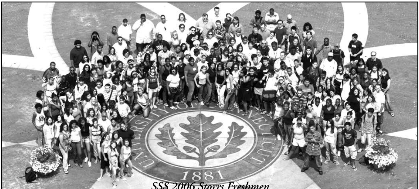
SSS 2006 Storrs Freshmen

hand in hand with the coordinator of the program. I have had the privilege to work and mentor the incoming SSS freshmen. I became an English tutor, and I was able to do what I like most, help other people in an area that I enjoy. As a result, I also received extensive training from the Tri-Campus writing center, where I now work during the school year. The SSS Program is a great opportunity and a huge advantage. I was glad to be accepted into such an honorable program and was able to work closely, not only with the students, but also with staff members. I do not regret the choice I made my senior year of high school because what I gained far surpasses what I lost.